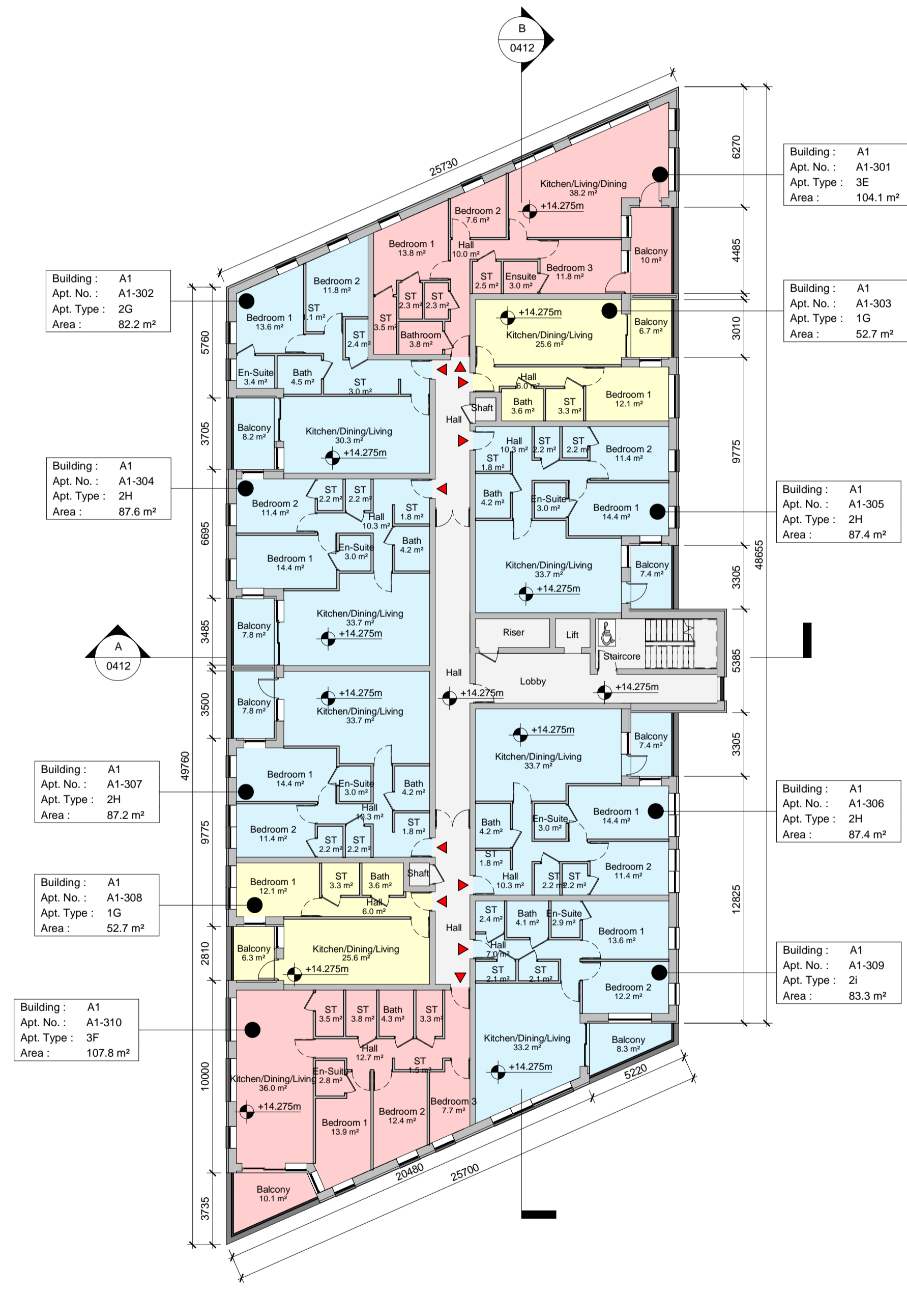
2 Third Floor Plan 1 : 200