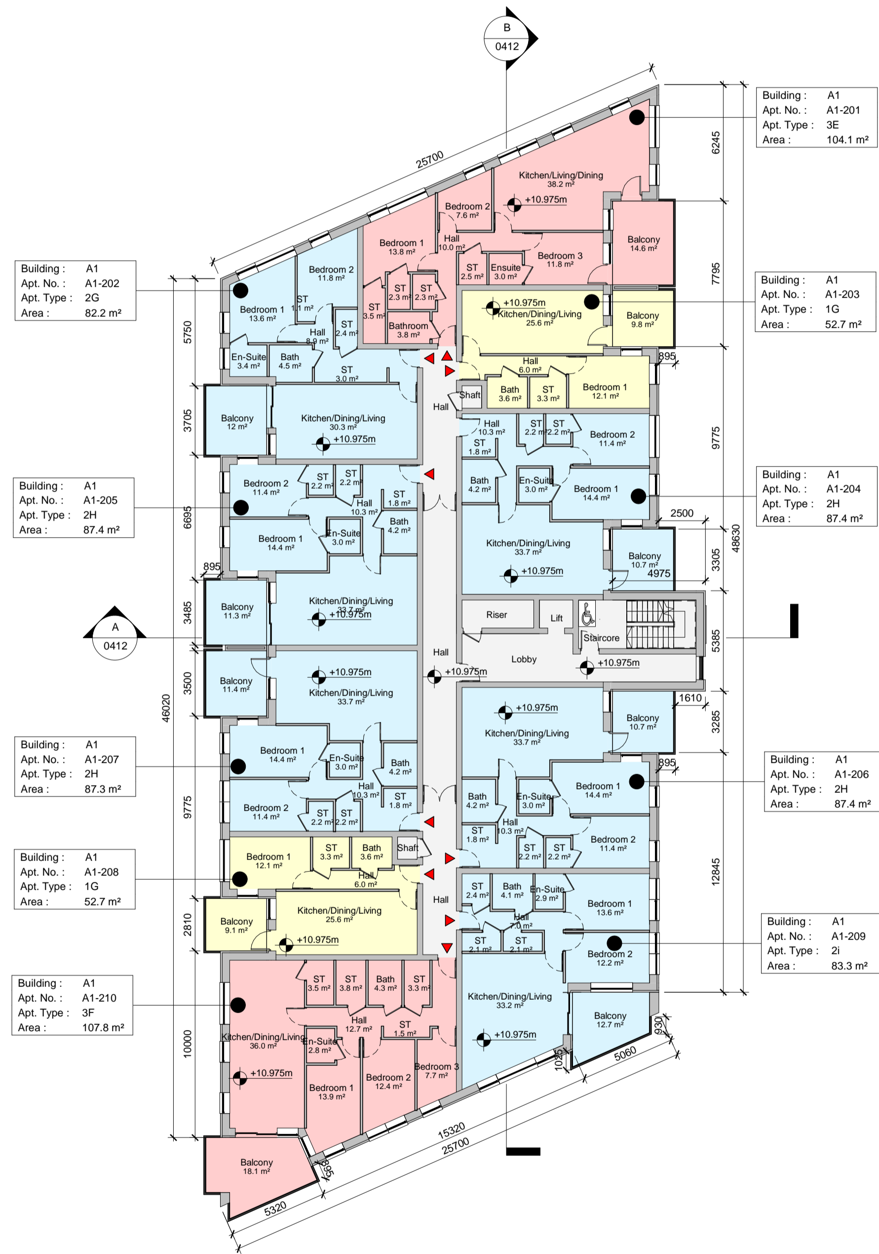
1 Second Floor Plan 1 : 200